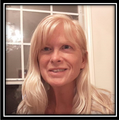
Kelly Spillane Small Business Advocate Office of the Governor- Economic Development & Tourism